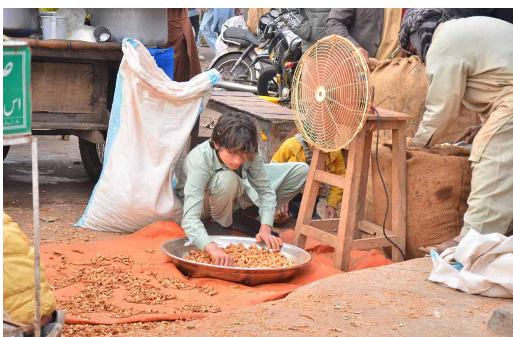
ISLAMABAD: A vendor is altering the peanuts at Fruit and Vegetables market of Sector I-11 in Federal Capital.