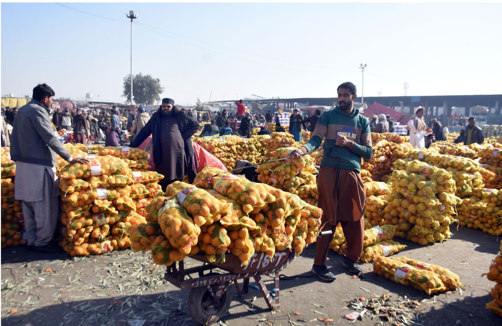
ISLAMABAD: Vendors are buying Oranges from wholesale dealers at Fruit and Vegetables market at Sector I-11 in Federal Capital.

frequently traded shares, and enhancing disclosure requirements for acquirers and listed companies. Provisions for voluntary offers, obligations of Manager to the Offer (MTO) and mechanisms for handling indirect or chain acquisitions have also been floated for further deliberations. The proposals have been developed following an initial round of consultations with various stakeholders including market experts, MTOs, law firms, chartered accountants and listed companies. The scope of consultations is now being expanded to ensure wider participation in finalizing proposed amendment areas so any amendments can effectively address the evolving needs of the market and its stakeholders. The consultation paper including rationale for each suggested area of improvement is uploaded on the SECP website.