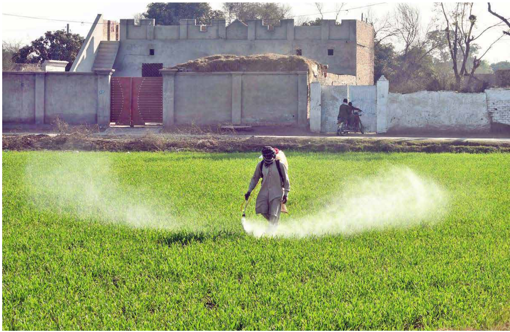
MULTAN: A farmer sprays pesticide on his wheat crop to protect it from harmful pests and ensure a healthy harvest on outskirts area in the city.