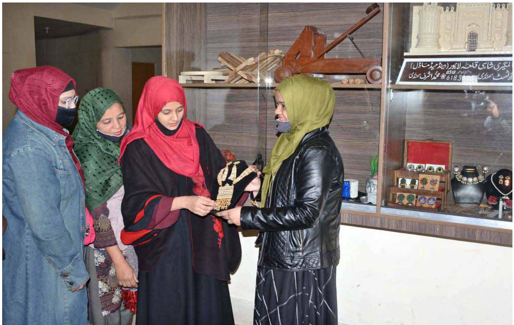
FAISALABAD: A craftswoman showcases her intricately handmade jewelry to a visitor at her stall during a Craft Exhibition organized by the Faisalabad Arts Council.