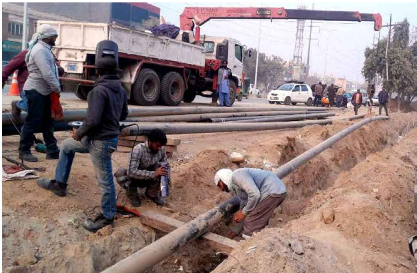
LAHORE: Labourers busy to install pipelines using heavy machinery at Walton Road, part of a major development project in the provincial capital.