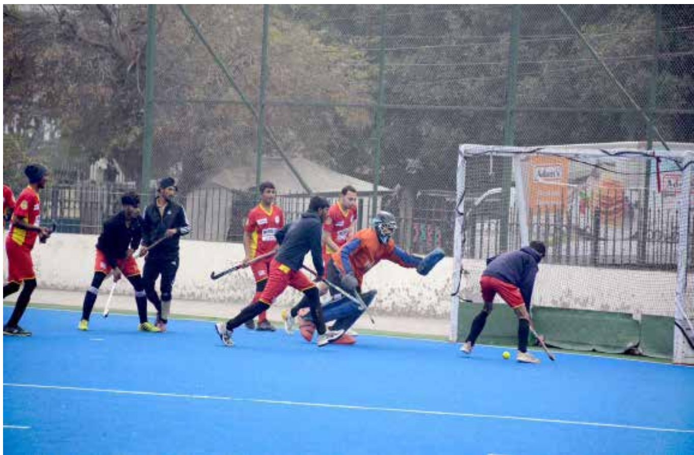
FAISALABAD: A thrilling hockey match between Paradies Hockey Club and Shahbaz Senior Hockey Club during the 2nd Chief of Army Staff Inter Club National Hockey Championship 2024, District Level Round 1 at Hockey Stadium Faisalabad.

The agency said last month that French Open champion Iga Swiatek had accepted a one-month suspension after testing positive for the banned substance trimetazidine following contamination of her sleep medication.