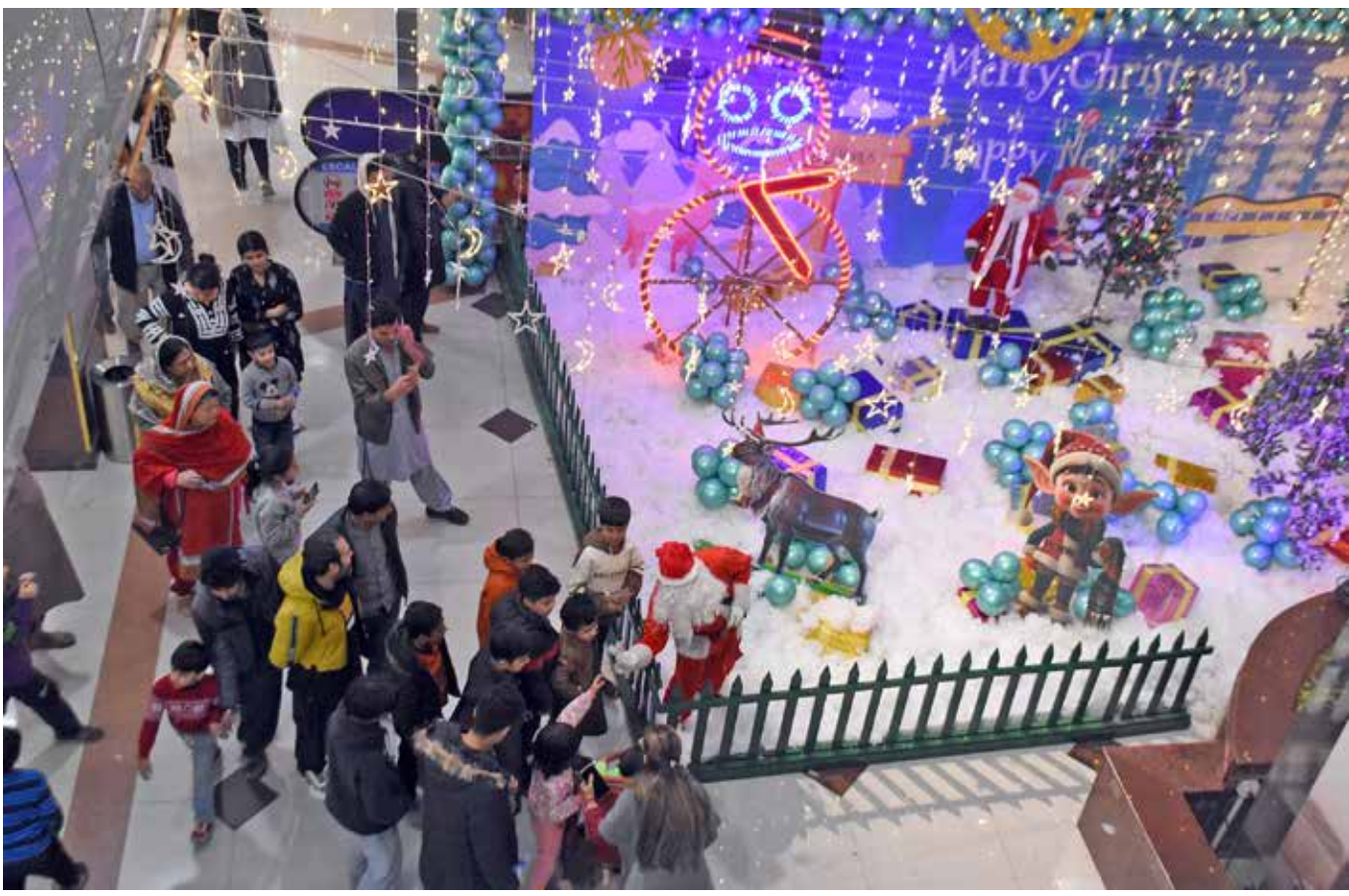
ISLAMABAD: Visitors looking decorated complex during celebration Christmas ceremony at a shopping mall, in the Federal Capital.