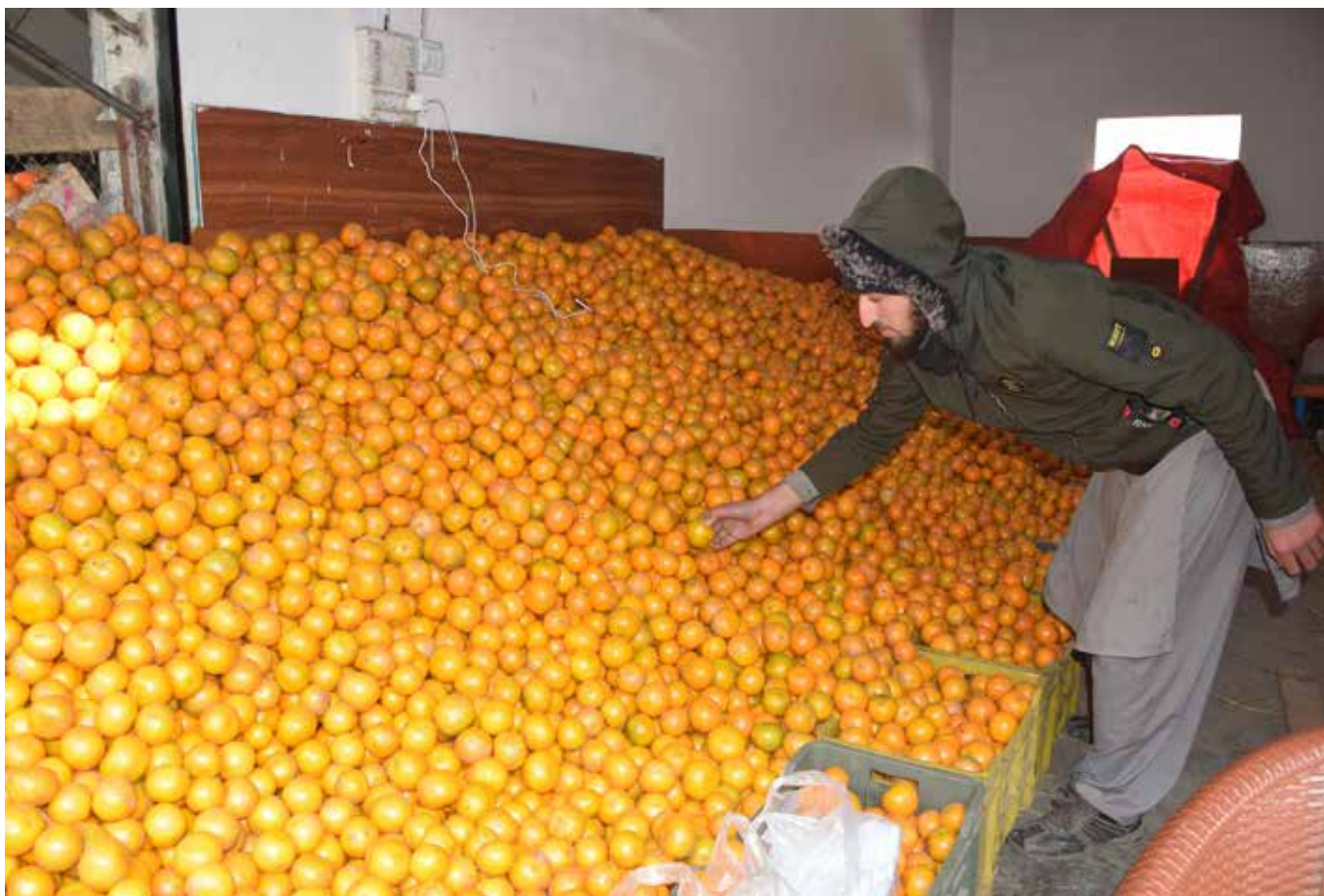
MUZAFFARABAD: A trader in a fruit market is decorating orange for sale.

Introduction of new investment products, such as Exchange-Traded Funds (ETFs), options markets, and derivatives, to enhance market attractiveness and exploring algorithmic trading and robo-advisory services, drawing insights from successful implementations in countries like China.