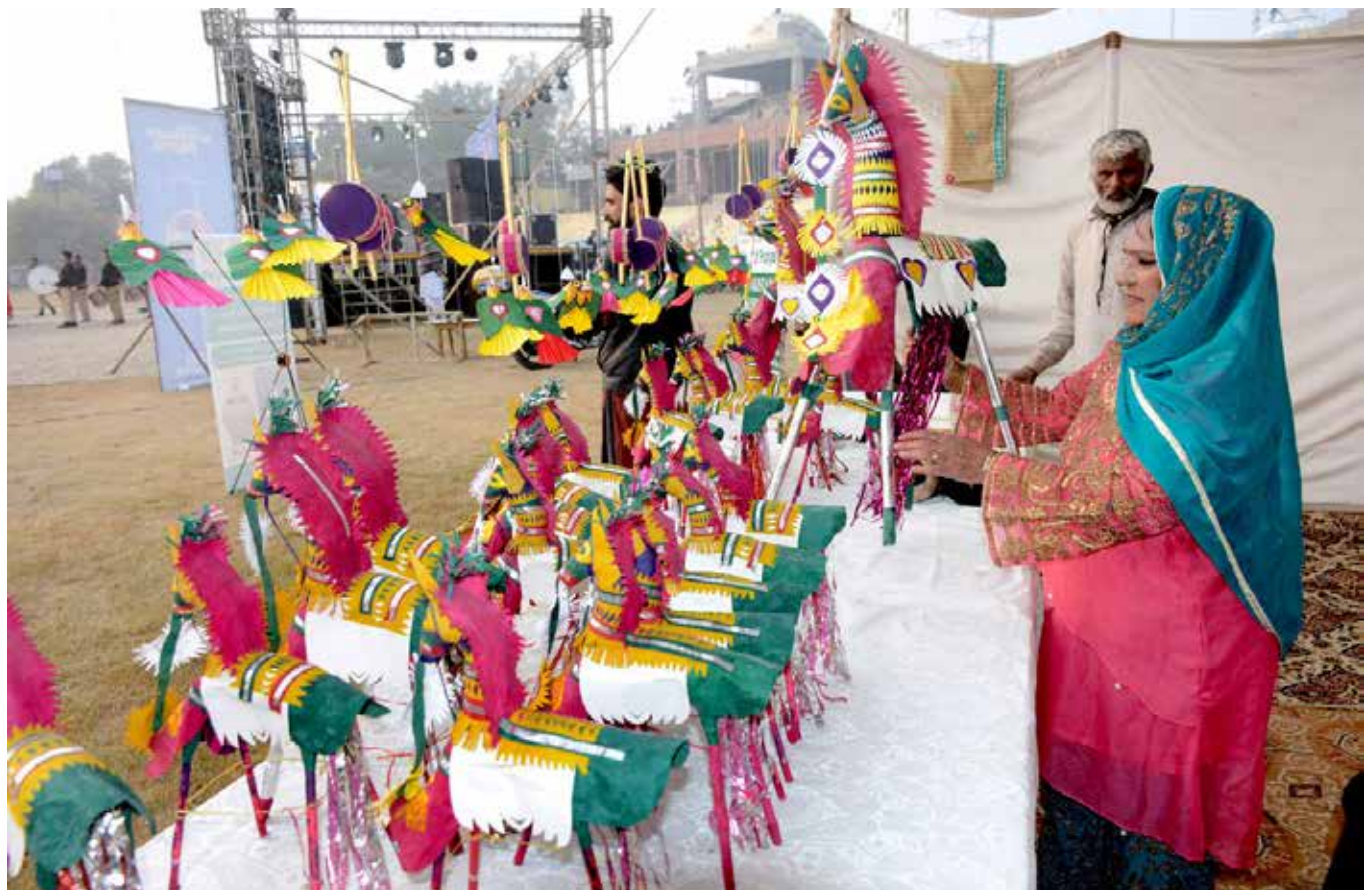
MULTAN: A nomad woman displaying handmade ‘Ghgho Ghode’ (colorful horses) at her stall for selling to attract the customer during a cultural festival organized by the District Government.